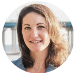
MEMBER OF THE YEAR

This annual award recognizes a Member for providing unwavering commitment to JLNW and to the community we serve.