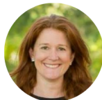
SUSTAINER OF THE YEAR

This annual award recognizes a Sustaining Member who has utilized her JLNW training and experience to continue to make a difference in the community.